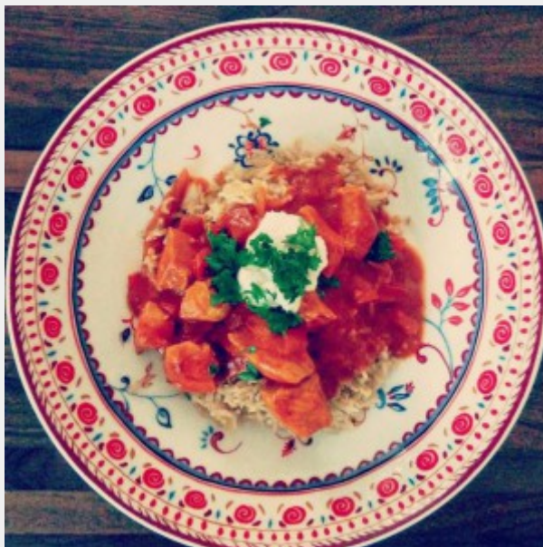
Butter Chicken Curry – Clean Eating Recipe

We'll imagine no more. Try out this butter chicken curry recipe with either wholegrain rice or quinoa (non-paleo option) or cauliflower rice (paleo option):