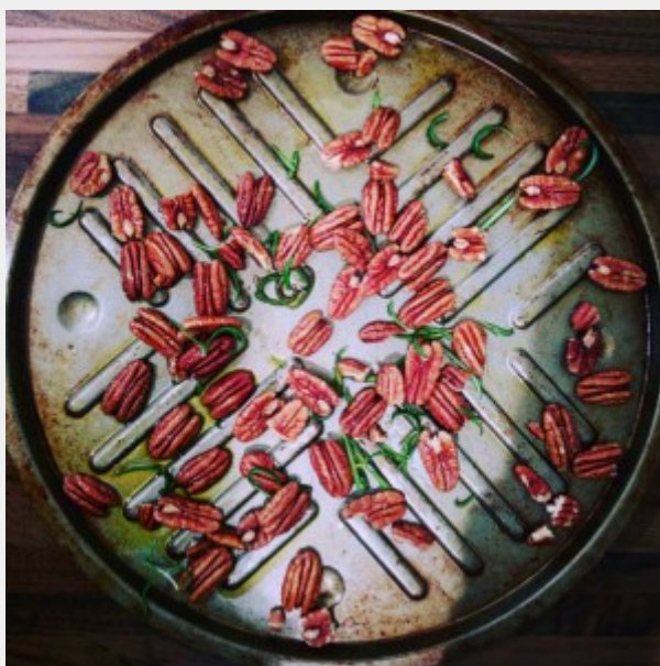
Healthy Snacks – Rosemary Roasted Pecans

So the January resolutions of getting fit and healthy are in full swing but there is one thing getting in your way; healthy snacks! So many people fall at this hurdle, they're at work and suddenly the munchies take hold of you and you're suddenly starving and it's hours until lunch time! Noooooooo! Then you check your purse and trundle off to the vending machine and buy the "healthy" flapjack! Be prepared people! Making your own healthy snacks so you can have a stash in your bag or in your desk drawer is a great way to make sure you don't fall off of the wagon! My latest healthy snack was inspired by Madeleine Shaw and is so quick and easy to make that you'll be kicking yourself for not having done it sooner!