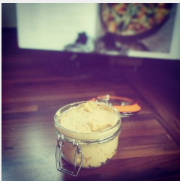
Homemade Hummus Recipe

Hummus is amazing! It's the one thing I cannot avoid when there are snacks out at a party! And the great thing is that if you make your hummus at home it's super duper healthy ☐